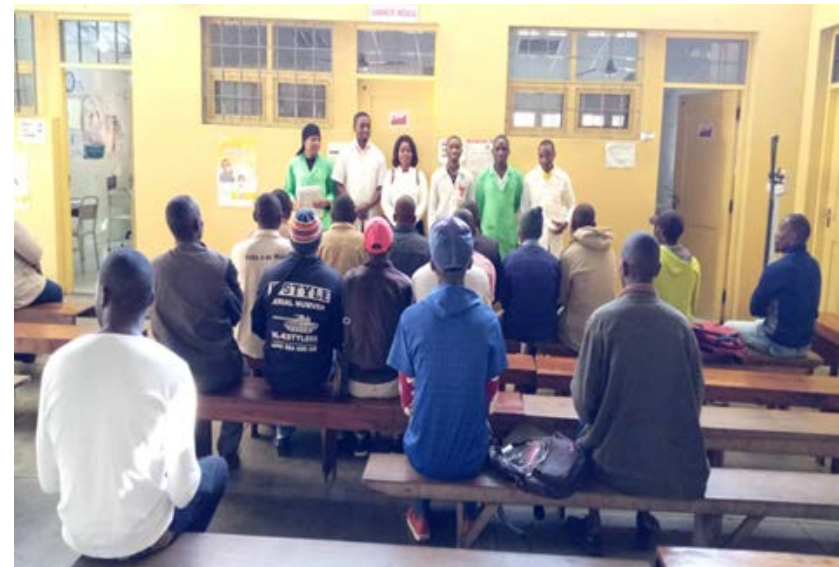
Fig – Male engagement activities at health facilities in Nampula and Manica provinces